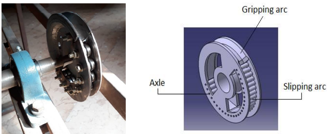
Fig. 1 designed and fabricated Pulse pulley

Pulse pulley is consisting of two parts one is gripping arc and second is slipping arc. As their name suggest, gripping arc holds the grip with belt drive and slipping arc creates the pause in power transmission because it does not create frictional grip with belt drive.