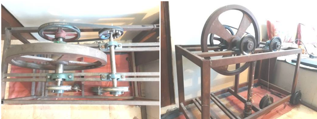
Fig. 2, top and side view of testing mechanism

For measuring difference between gradual and impulsive power transmission using conventional pulley and pulse pulley, I construct testing mechanism as shown in figure 2 bellow.