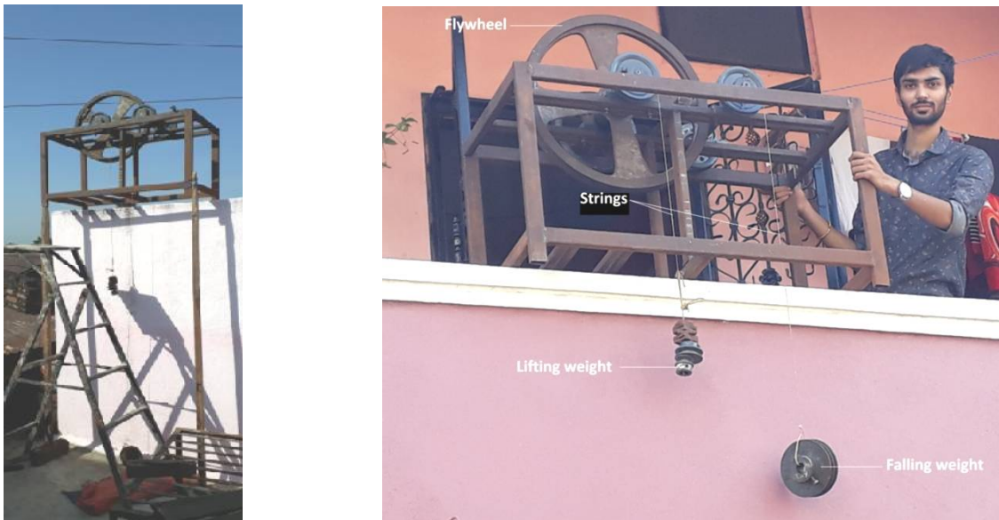
Fig. 3, testing mechanism kept at different heights during testing

Due to gravitational force of attraction on falling weight, the speed of the input shaft continuously increases till the falling weight touches the ground (datum) hence; test is carried out from variable heights to get variable speeds at input shaft.